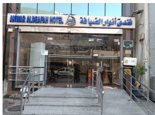
Anwar Deafah Hotel (OR Similar)