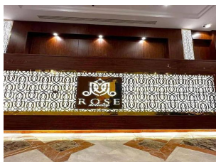
Rose Holidays (OR Similar)