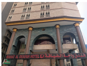
Waha Al Deafah Hotel (OR Similar)