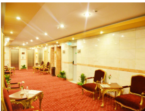
Burj Al Deafah Hotel (OR Similar)