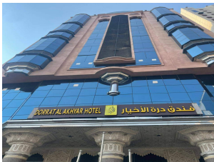
Dorrat Al Akhyar Hotel (OR Similar)