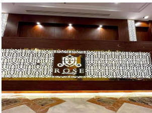
Rose Holidays (OR Similar)