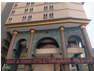
Waha Al Deafah Hotel(OR Similar)