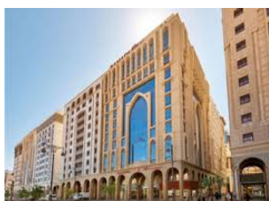
Nusk Al Eiman (OR Similar)