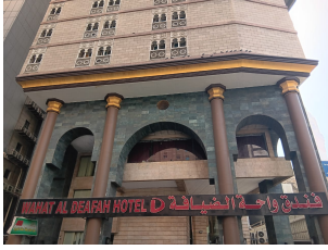
Waha Al Deafah Hotel (OR Similar)