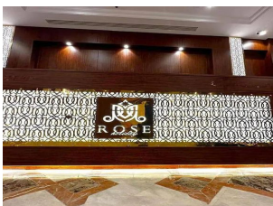
Rose Holidays (OR Similar)