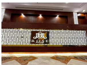
Rose Holidays (OR Similar)