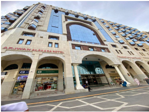
Erjwaan Saada Hotel (OR Similar)