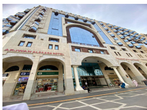
Erjwaan Saada Hotel (OR Similar)