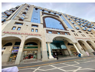
Erjwaan Saada Hotel (OR Similar)