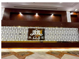
Rose Holidays (OR Similar)