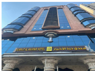
Dorrat Al Akhyar Hotel (OR Similar)