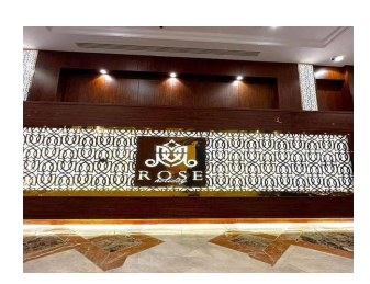
Rose Holidays(OR Similar)