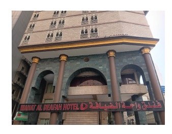
Waha Al Deafah Hotel(OR Similar)