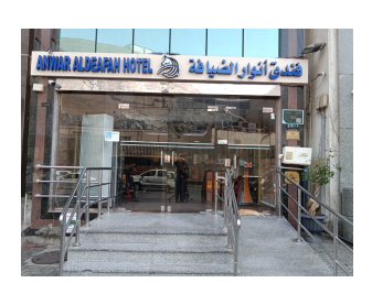
Anwar Deafah Hotel (OR Similar)