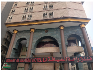
Waha Al Deafah Hotel(OR Similar)