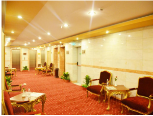
Burj Al Deafah Hotel(OR Similar)