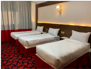
Mona Salam Hotel(OR Similar)