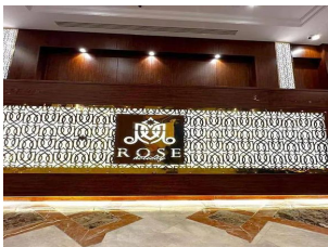
Rose Holidays (OR Similar)