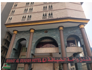
Waha Al Deafah Hotel(OR Similar)