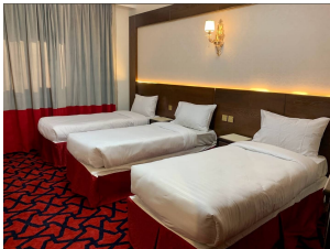
Mona Salam Hotel(OR Similar)