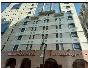
Taiba Rose Hotel (OR Similar)