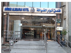
Anwar Deafah Hotel (OR Similar)