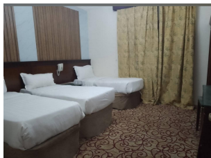
Sebal Plus Hotel (OR Similar)