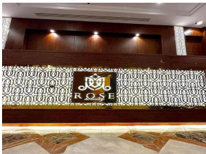
Rose Holidays (OR Similar)