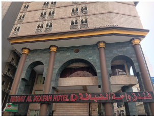
Waha Al Deafah Hotel (OR Similar)