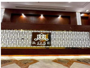
Rose Holidays (OR Similar)