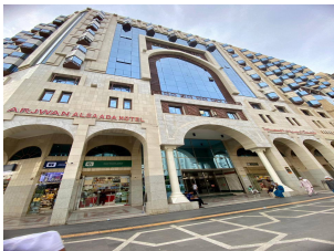
Erjwaan Saada Hotel (OR Similar)