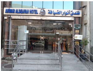
Anwar Deafah Hotel (OR Similar)