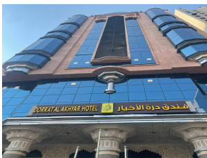
Dorrat Al Akhyar Hotel (OR Similar)